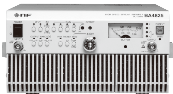
BA4825 : DC to 2MHz, 100Vrms (300Vp-p), 0.5Arms

BA Series BA4825 [2MHz Type] / BA4850 [50MHz Type]