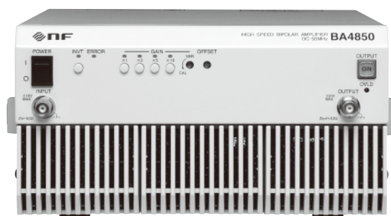
BA4850 : DC to 50MHz, ±20V, ±1A

The BA Series are power amplifiers that handle DC to 50MHz (max.) signals and output broadband, high speed, and high voltage (300Vp-p max) bipolar (both positive and negative polarities) outputs. While ordinary DC power supplies only supply one-way currents, the BA Series amplifiers supply (source) and absorb (sink) currents, and handle positive and negative voltages as well, because they operate across all four quadrants.